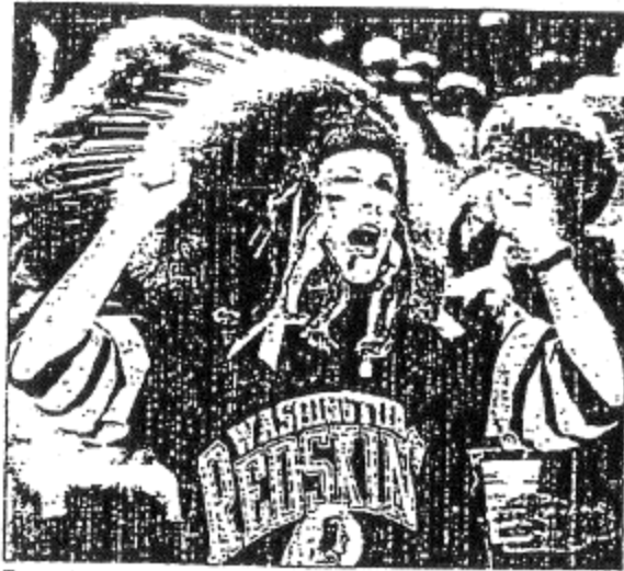
The Indian Girl cheers on the Redskins during their opening game.